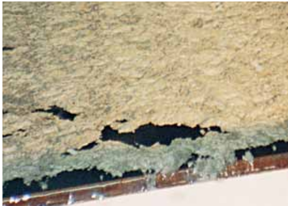
This floating sludge blanket is a mass of solids created by floating low-density suspended particles that have not settled out in the wastewater lagoon.

With the Clari-DAF® LT system, the solids content that can be achieved is 3% to 5% compared to 0.5% to 1% for gravity sedimentation. This results in increasing the efficiency of sludge handling equipment and reduction in the cost for sludge processing. Dewatering can occur without additional thickening, eliminating expensive sludge thickeners. There is less volume of sludge to handle, less chemical conditioning, less time to dewater, and lower energy costs. Because cake solids are higher, disposal costs are reduced.