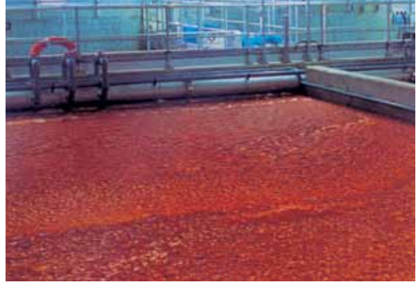
The next step for this sludge produced by a Clari-DAF® LT system is dewatering where higher cake solids result in lower disposal cost.