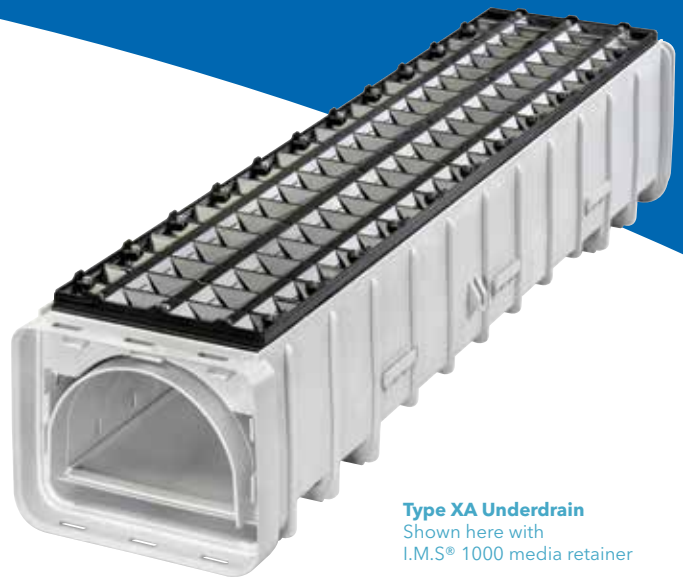
Type XA Underdrain Shown here with I.M.S® 1000 media retainer