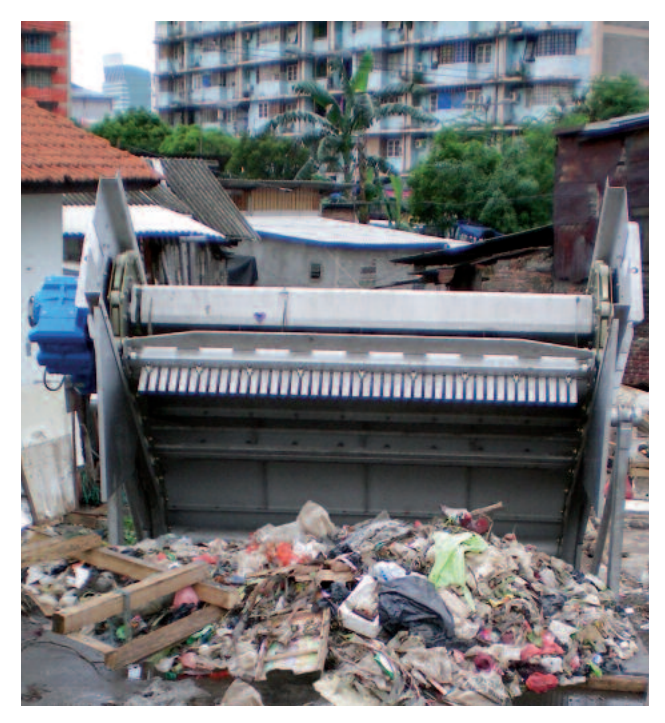
Free screenings discharge without blockage