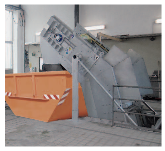
Indoor installation with screenings discharge directly into a container

up to 20 m ≥ 20 mm Bar spacings: 80° Installation angle: