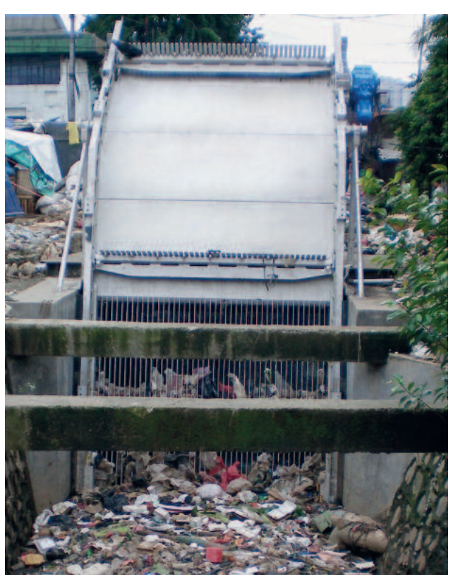
HUBER Coarse Screen TrashMax® in operation