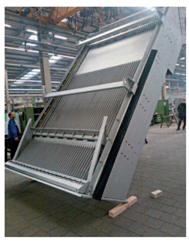
HUBER Coarse Screen TrashMax® after assembly ready for a test run