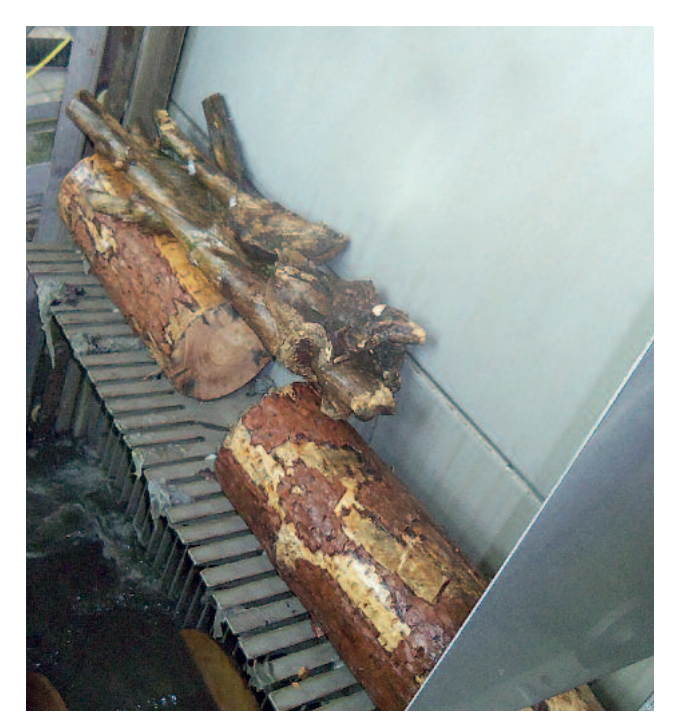
The screen rack is cleaned by very robust high-capacity rakes. The number of cleaning rakes can be variably adapted, removal capacity is then adjustable. Even extremely bulky objects are reliably removed by the screen rakes and transported upwards out of the channel to the screenings discharge.