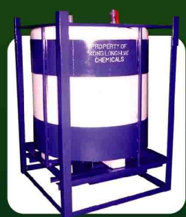
IBC Tank - Cylindrical IBC with Forkliftable Base