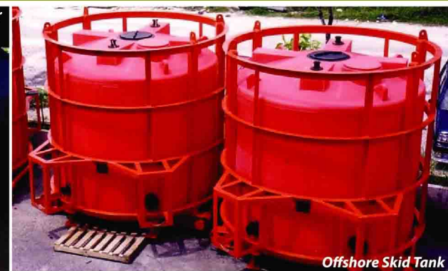
Offshore Skid Tank