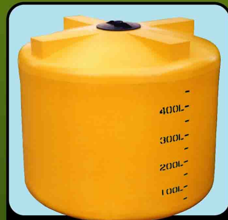
CPE Tank - with dome top