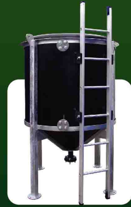
C-CT - Conical Base