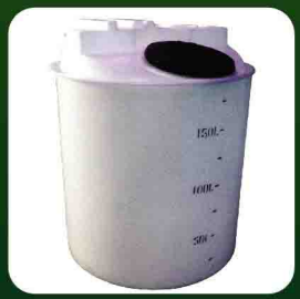
AE - Dosing Tank