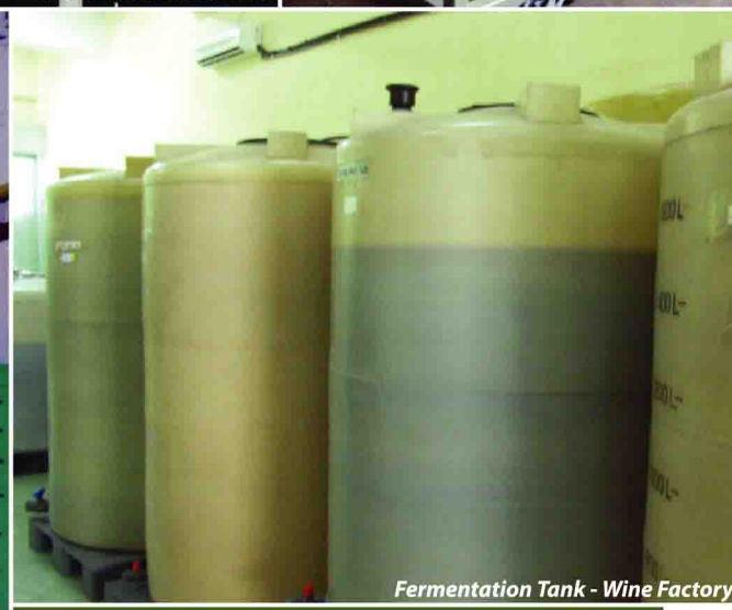
Fermentation Tank - Wine Factory