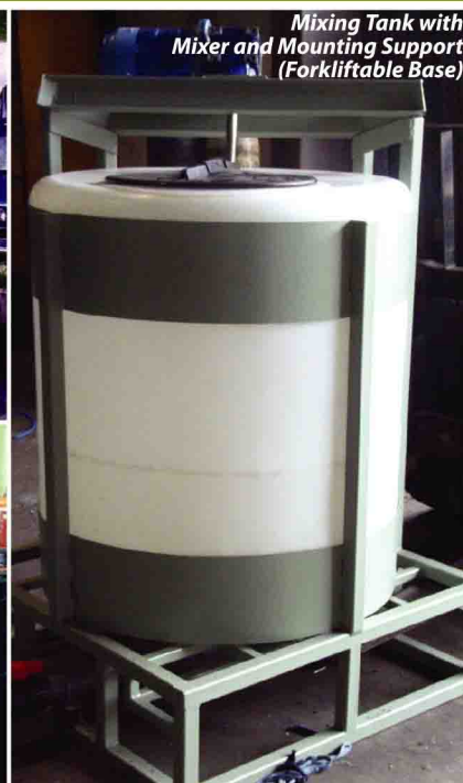
Mixing Tank with Mixer and Mounting Support (Forkliftable Base)