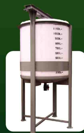
C-DT - Dome Base with Stirrer Mounting Support