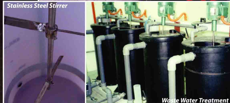
Waste Water Treatment