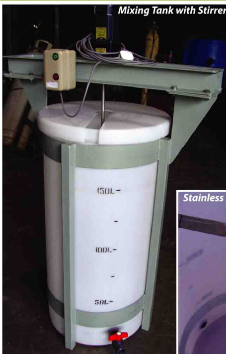
Mixing Tank with Stirrer