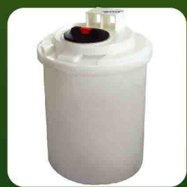
Double Containment Tank / Jacketed Tank